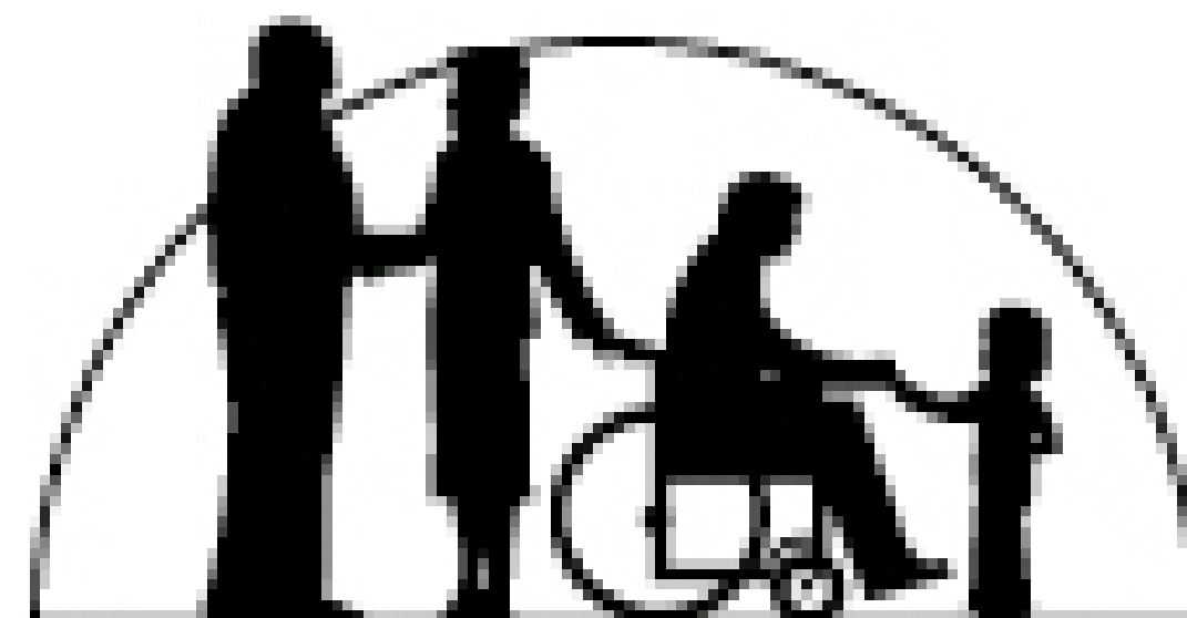
Minnesota Department of Human Services