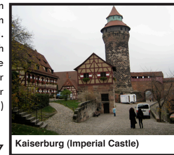
Kaiserburg (Imperial Castle)

to Berlin Gesundbrunnen Station for departure on ICE train to Nuremberg. Upon arrival, walk with local assistant to the Park Inn Nuremberg for check-in. Guided tour of Altstadt (Old City) and Kaiserburg. (B)